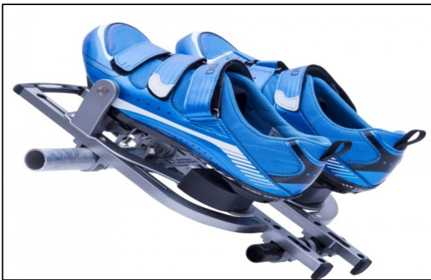
Figure 2. Example of Foot Stretchers where shoes come out of the boat

The heels on this type of foot stretcher MUST not be tied down as this would be contrary to the safety features of this type of foot stretcher where the shoes are intended to come out of the boat with the athlete.